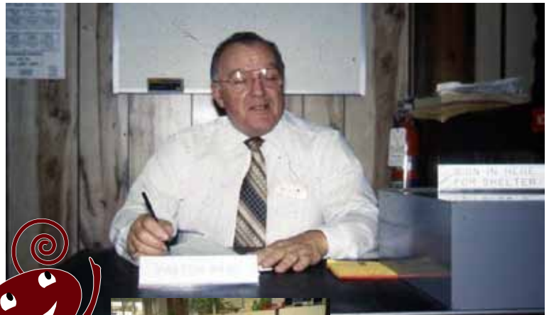
The picture featured in the May newsletter showed the 607 E. Michigan Ave. office in the late 1980s.

While sorting through boxes and boxes of old slides and negatives, we can see the progress of time, as life at and around the Mission continues to adjust and change. See if you recognize the person in this photo. Check out next month's newsletter or the Mission facebook page to see if your guess was correct.