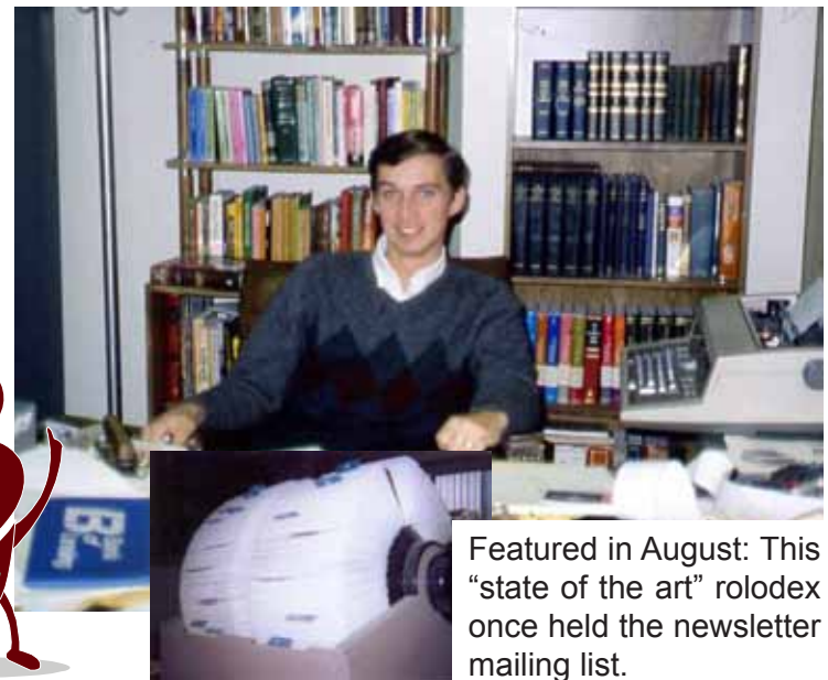
Featured in August: This "state of the art" rolodex once held the newsletter mailing list.

This photo was taken in 1988. Do you recognize this former staff member? Hint: he's now on the board. Check out next month's newsletter or the Mission facebook page to see if your guess was correct.