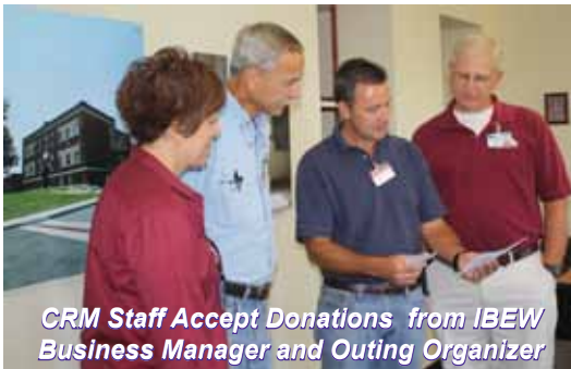
CRM Staff Accept Donations from IBEW Business Manager and Outing Organizer

We are so grateful to the many groups who chose to support the Mission through their annual charity golf outings. Board of Water & Light and IBEW Local 352 collected monies for the Mission and Pennies for Power; South Church had their annual golf scramble; and Capital Area Women's Lifestyle Magazine has once again chosen to donate the proceeds of the Lady Classic, on September 15, for the Mission's Maplewood Center. (For further information on the Lady Classic visit www.cawlm.com/lady-classic-2011 .) These funds will help us continue to provide for those in need.